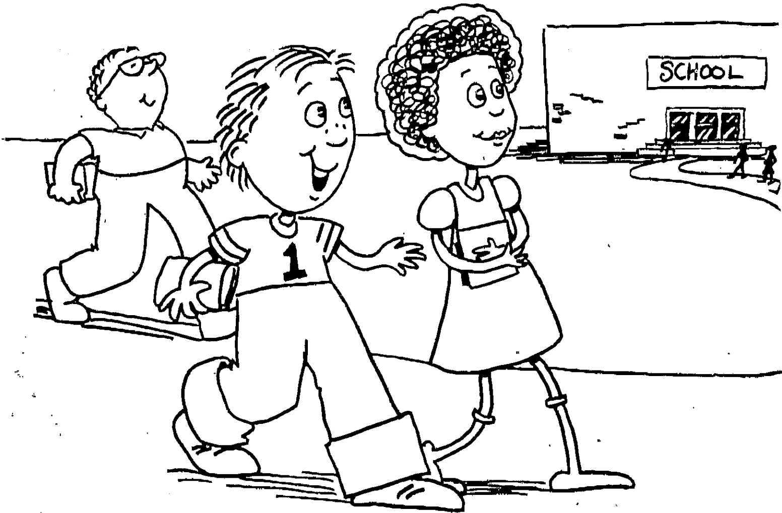
Illustration by Paul Sharp